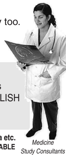
Medicine Study Consultants

Our sister universities are in USA, Canada, UK, Australia etc. GOOD HOUSING, PAYMENT PLANS & SCHOLARSHIPS AVAILABLE